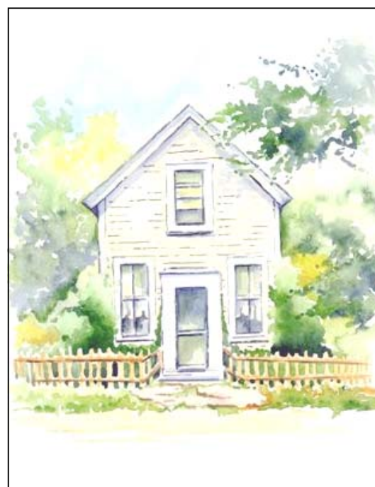
Ekdahl House Watercolor by Peggy Taylor. This image was graciously donated by Peggy to the Ekdahl Museum. Note cards with this image are available at the Western Springs Historical Society Tower Museum, Saturdays from 10:00-12:00.

In July the work and volunteer efforts continued. A new electric service was installed. The old plaster ceiling was removed to expose the wood beams for a backdrop for the new lighting system to be installed in the museum. The chain link fence was removed and the Boy Scouts from Troop 216 helped us to clean up the site.